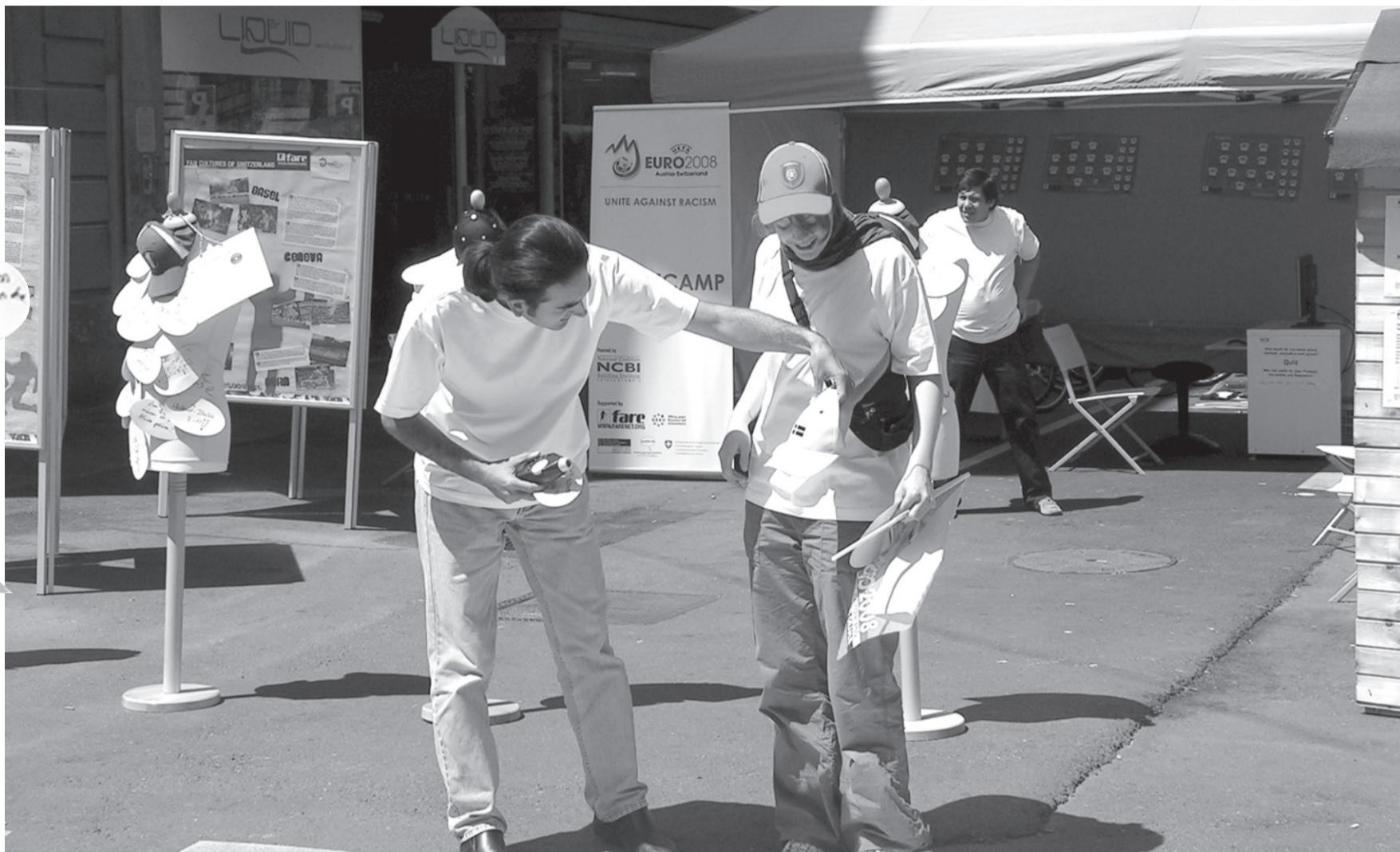
DUMMY: The volunteers are a huge help in National Coalition Building Institute's organizations (upper photo.) The photo on the left is a dummy representing a Dutch. Prejudices about the Dutch people, such as 'weed smokers' and 'wearing wooden shoes,' are written on the papers attached to the dummy.

France coach Marc Lievreumont has ruled out making wholesale changes for the second test against Australia next weekend despite his side's 34-13 loss to the Wallabies in Sydney Saturday. The French, missing a string of first choice players due to club commitments, face Australia in Brisbane next Saturday. Lievreumont said he did not anticipate many personnel changes following a second half capitulation, which saw the Wallabies score 24 unanswered points in a 15-minute period. "Unfortunately, there is only one week before the next test and less time for recuperation," Lievreumont said. "We showed that we need to play more together and there won't be too many changes." BRISBANE - Reuters